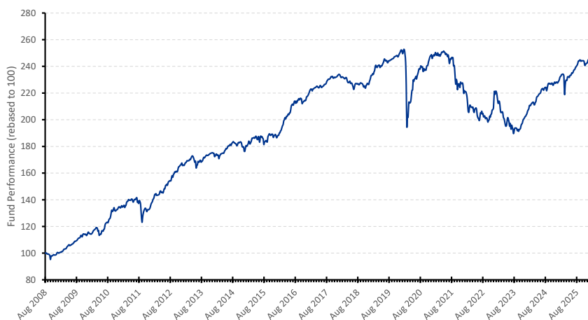
A USD (Acc)